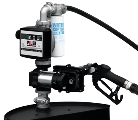
PIUSI EX50 Drum Kit 4m Hose, Filter, Auto Nozzle & Meter