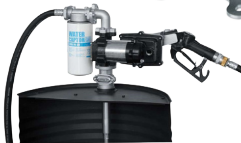
PIUSI EX50 DC Drum Kit 4m Hose, Filter and Auto Nozzle