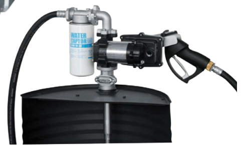
PIUSI EX50 DC Drum Kit 4m Hose, Filter and Manual Nozzle